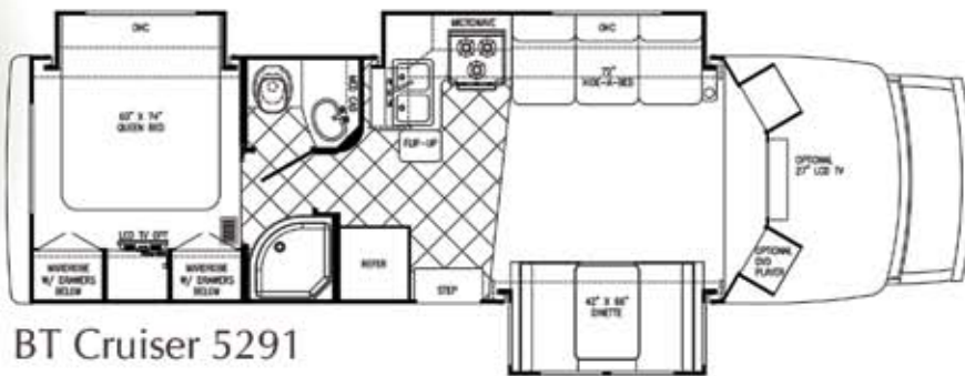
BT Cruiser 5291